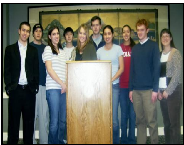
Members of the newly established OMSLD Toastmaster's Club stopped to pose for a group photo after a meeting. The next Toastmaster's meetings are April 7th and 14th. It's never too late to develop skills that will have you succeed in the future!

The Emerging Leaders Toastmaster's Club and the Office of Mentoring Services and Leadership Development have teamed up this semester to establish our own Toastmaster's Club. Toastmaster's club is a terrific organization that will help you enhance and improve your listening, public speaking skills, speech delivery and leadership development. There is no instructor; instead, each speech and meeting is critiqued by a member of the group in a positive manner, focusing on what was done right and what could be improved. Our toastmaster's club meets twice a month on Monday at 7PM in the Sassafras Room in the Indiana Memorial Union. The next meetings will be on April 7th and 14th. Commit to your future success today by joining this great group. Contact omsld@indiana.edu for more information on how you can involved today!